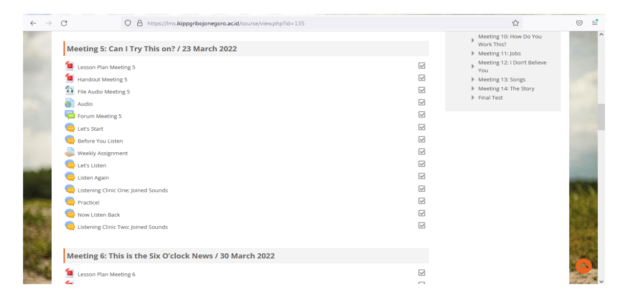
Picture 2. Presentation features in the Listening for Social Issues course using Moodle