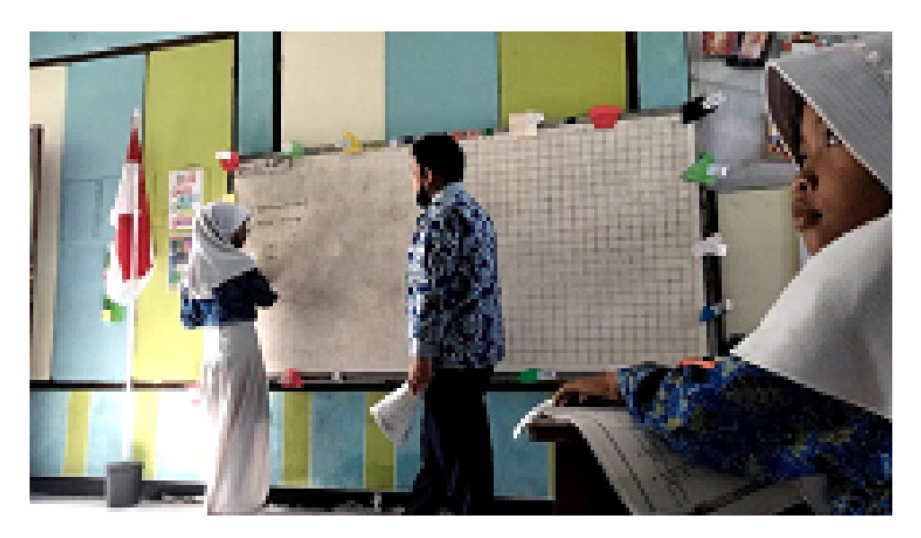
Figure 2: Strengthening students' numeracy skills (Grade 4).

students have also led aerobic exercise which was participated by all students and teachers at SD Negeri Bakalan 1. Students also assisting the implementation of PJOK (Physical Sport and Health Education) learning. In addition, students have also succeeded in familiarizing students to carry out classroom hygiene pickets in order to create a clean and healthy learning environment. Students also provide education about first aid for injuries and minor injuries. This healthy life habit education activity allows students to understand and implement a clean and healthy lifestyle.