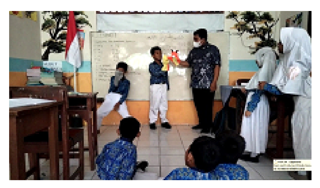
Figure 1: Strengthening students' literacy skills through storytelling activities with hand puppets (Grade 3).

category. The results of the AKM Class post-test showed the success of the program implementation with details of 21 students in the proficient category and 13 students in the advanced category. This shows that the strengthening of literacy that has been carried out significantly impacts students' literacy skills. Figure 1 shows the evidence of the implementation of literacy strengthening during classroom learning: