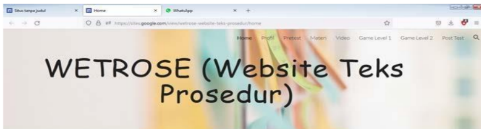
Figure 1. Procedure Text Website (WETROSE) Menu

The results achieved in this study are procedures text website (WETROSE) to implement the Merdeka Belajar program for junior high school students. First, the Procedure Text Website (WETROSE) has several menus, including: (1) home, which displays all the information on the website; (2) profiles, which contain information, vision, mission, and purposes for the creation of WETROSE; (3) pre-test, which contains practice questions to test students' initial ability to the material to be discussed; (4) Material, containing about the text materials of the procedure text for level 1; (5) material, containing material and exercises for level 2 procedure text questions; and (6) post-tests, containing practice questions that serve to measure students' ability after learning the procedure text material through procedures text website (WETROSE). Learning about the procedure text material is carried out by referring to all the stages on the Procedure Text Website (WETROSE). An example of a Website Text Procedure (WETROSE) page can be seen in figure 1 as follows.